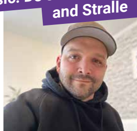
Music: DJ's Tetrastyle and Stralle